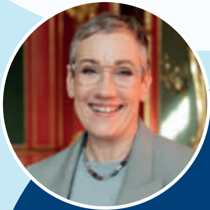
Sibylle Keupen Lord Mayor of Aachen

“Democracy is not a delivery service. It thrives on participation and only survives if we are able to defend ourselves together and live and demand decency outside our own four walls - this applies to all of us, regardless of whether we have a migration background or not.”